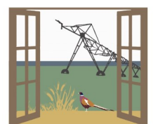
FRANKLIN CONSERVATION DISTRICT